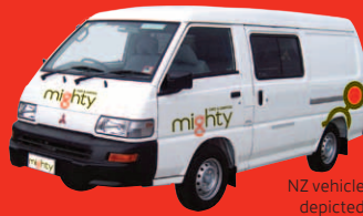
NZ vehicle depicted