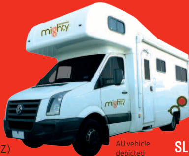
AU vehicle depicted