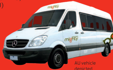
AU vehicle depicted